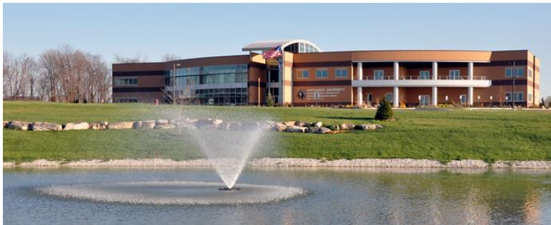
VUGC, Gibson Center for Advanced Manufacturing and Logistics, Fort Branch, Indiana