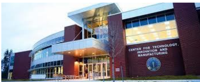
VU CTIM, Center for Technology, Innovation and Manufacturing, Jasper, Indiana