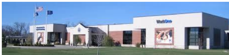
VU ICAT, Indiana Center for Applied Technology, Vincennes, Indiana