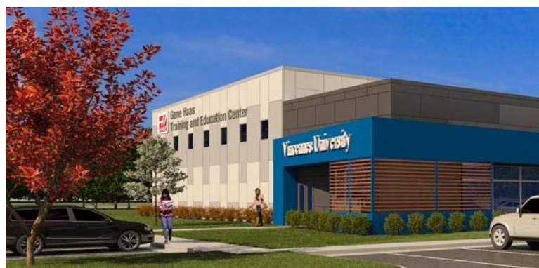
Gene Haas Training and Education Center Lebanon, Indiana